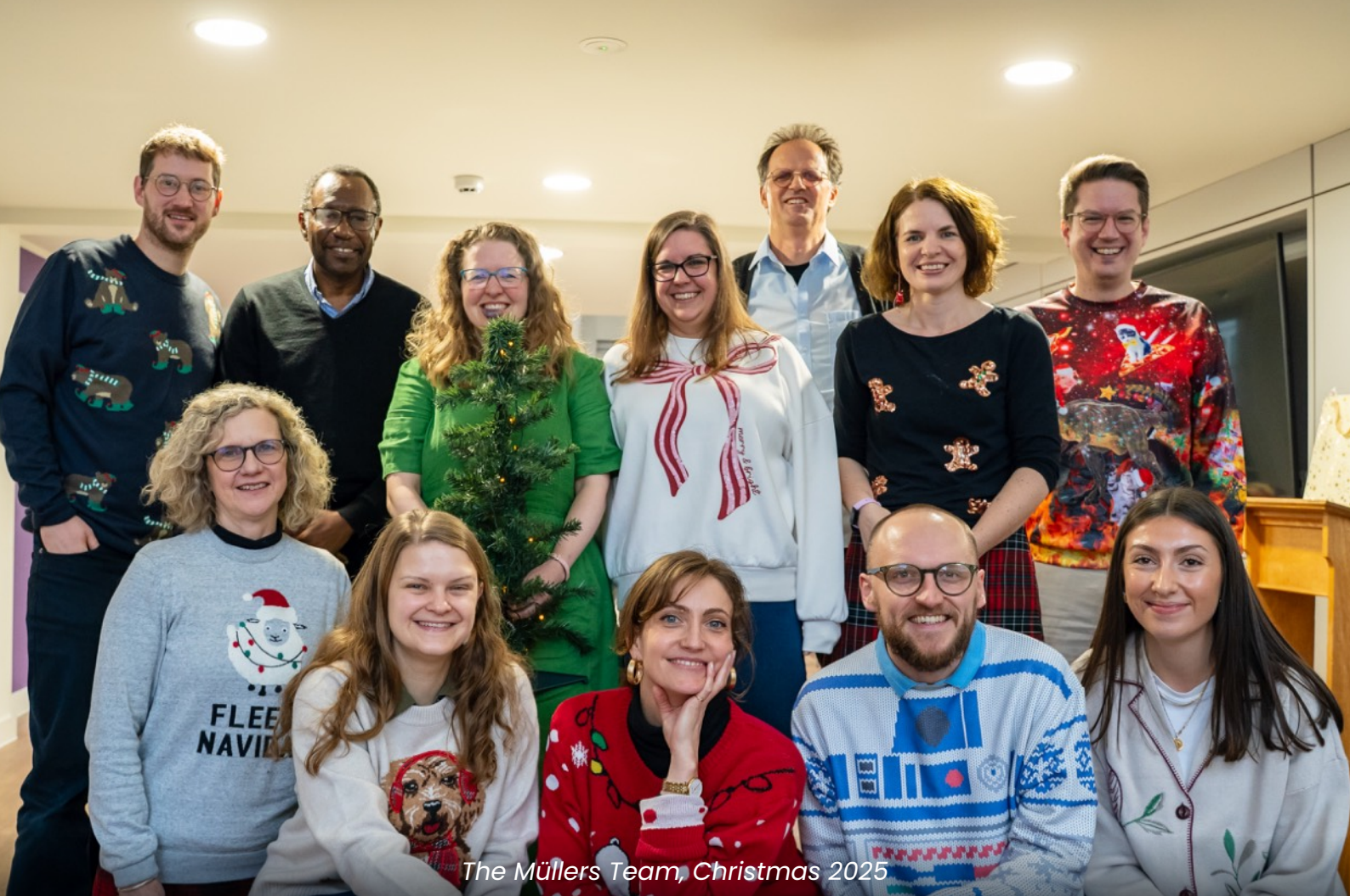
The Müllers Team, Christmas 2025

"I have absolutely loved working for Müllers. This has been the best team I have ever worked with, and Müllers the best employer I have ever had. I am so grateful to have been able to spend 3 years with you all."