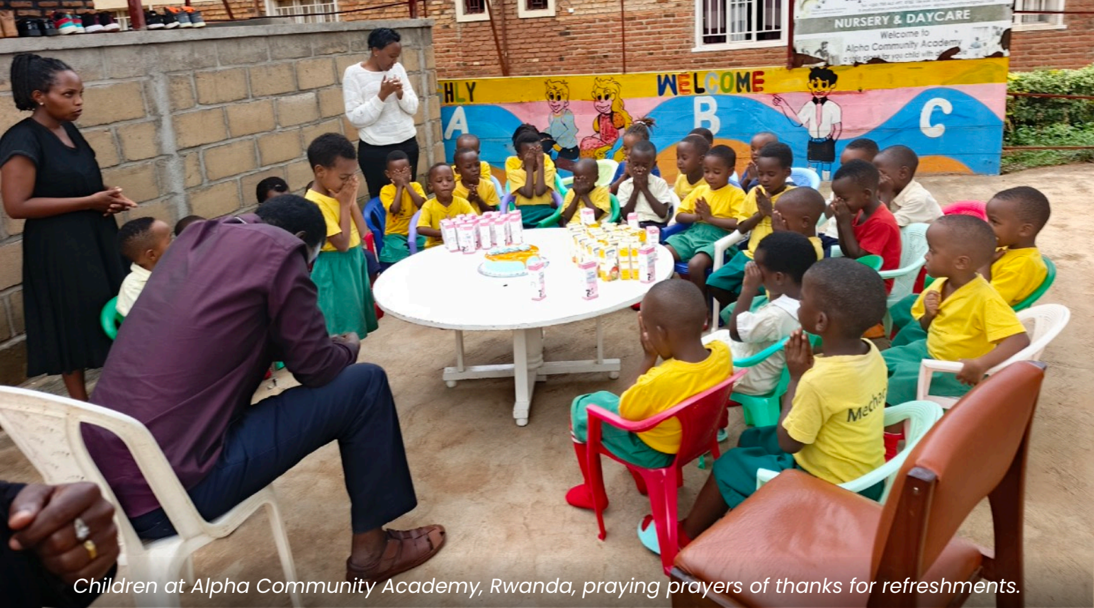
Children at Alpha Community Academy, Rwanda, praying prayers of thanks for refreshments.