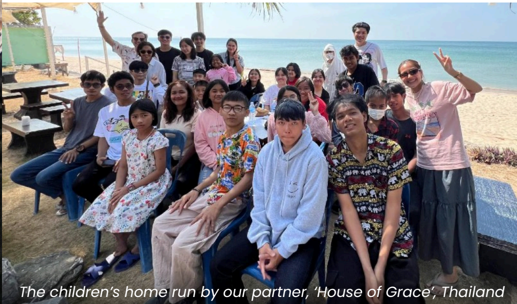
The children's home run by our partner, 'House of Grace', Thailand