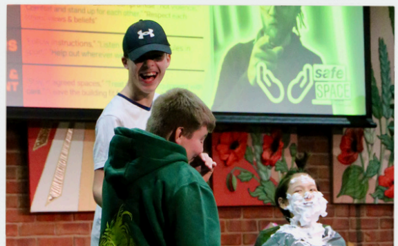
Shaving foam mess