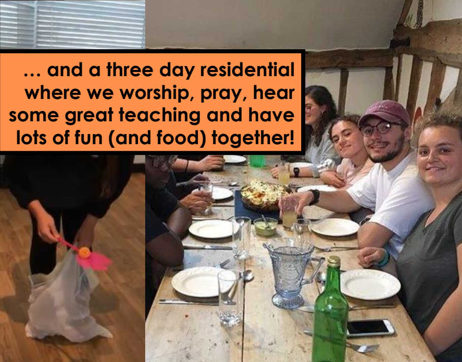
... and a three day residential where we worship, pray, hear some great teaching and have lots of fun (and food) together!