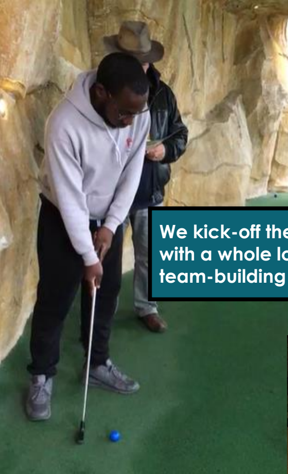
We kick-off the Encounter year with a whole load of team-building activities...