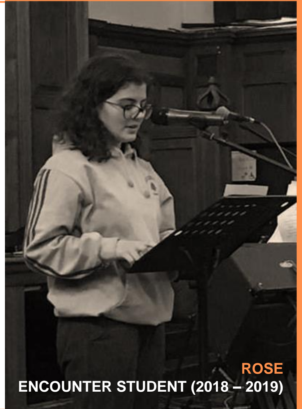
ROSE ENCOUNTER STUDENT (2018 – 2019)