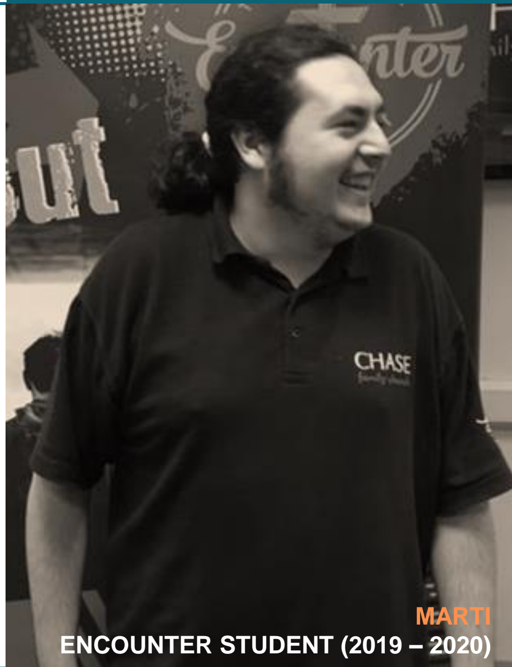
MARTI ENCOUNTER STUDENT (2019 – 2020)