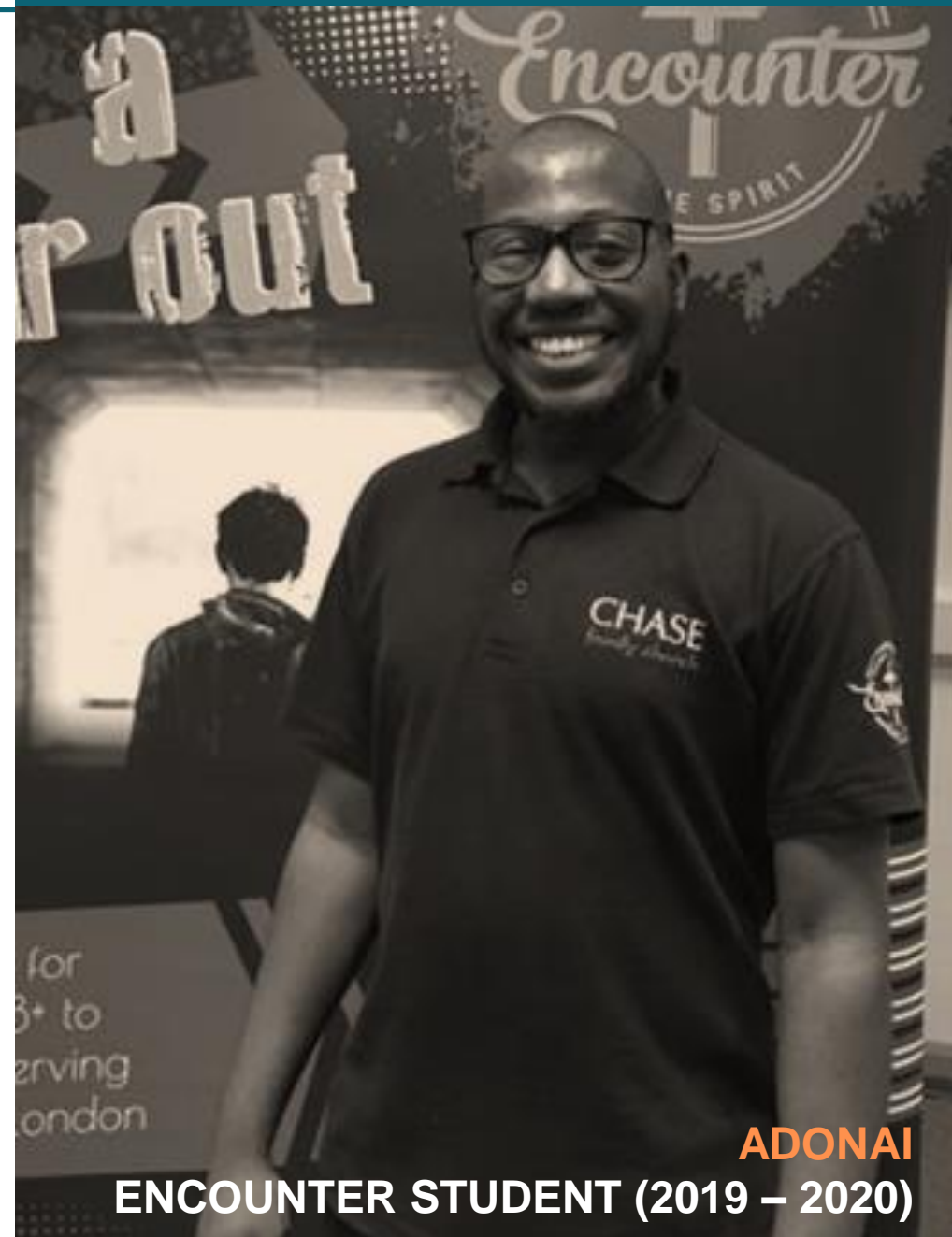
ADONAI ENCOUNTER STUDENT (2019 – 2020)