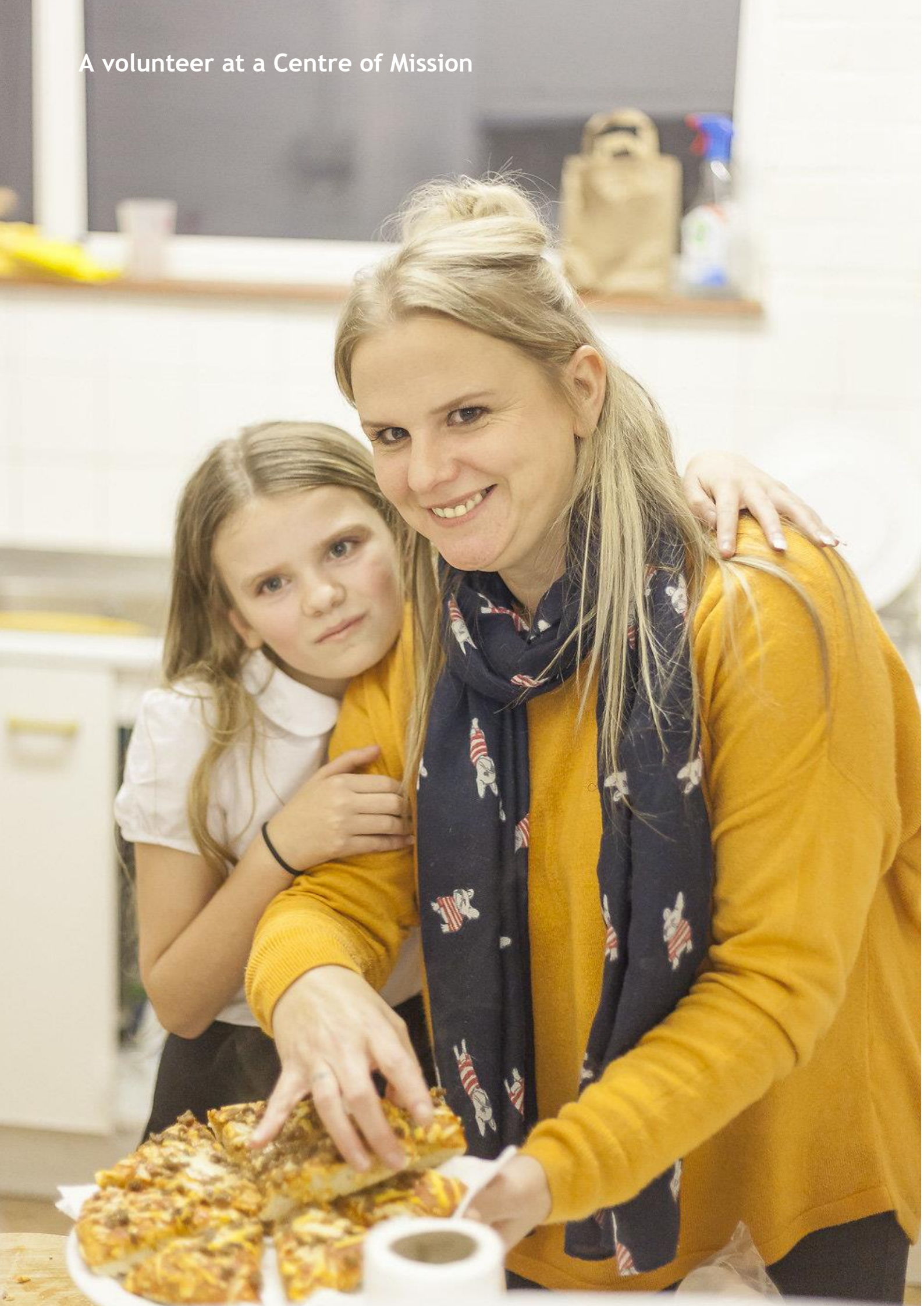
A volunteer at a Centre of Mission