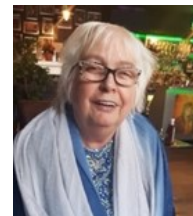
June (Finance MT)